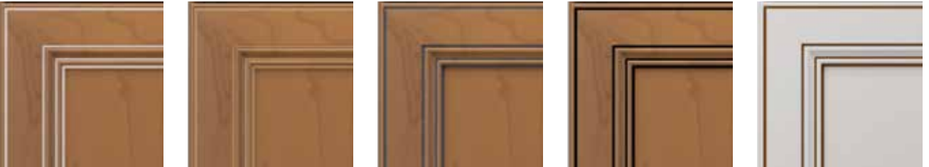
Alabaster Caramel Slate Chocolate Mocha (on paint only)