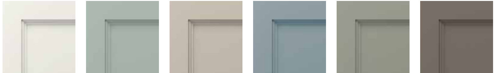
Cashmere PH PO Dewdrop PH PO Parchment PH PO Lagoon PH PO Sagewood PH PO Truffle PH PO