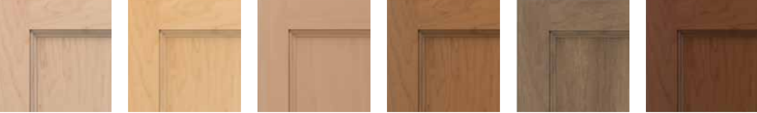
Unfinished B O M C Natural B O M C Jute B O M C Nutmeg B O M C Drift B O M C Cocoa B O M C