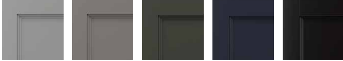
Cloud PH PO Storm PH PO Hunt PH PO Hatteras PH PO Midnight PH PO