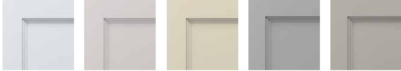
Alpine PH PO Salt PH PO Linen PH PO Greystone PH PO Pebble PH PO